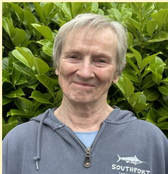
Last but not least: Dee May Communications