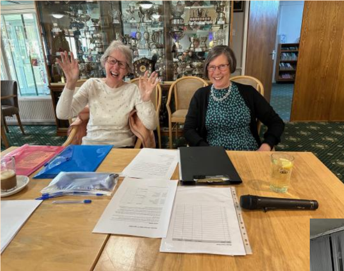
Our Quiz Masters!