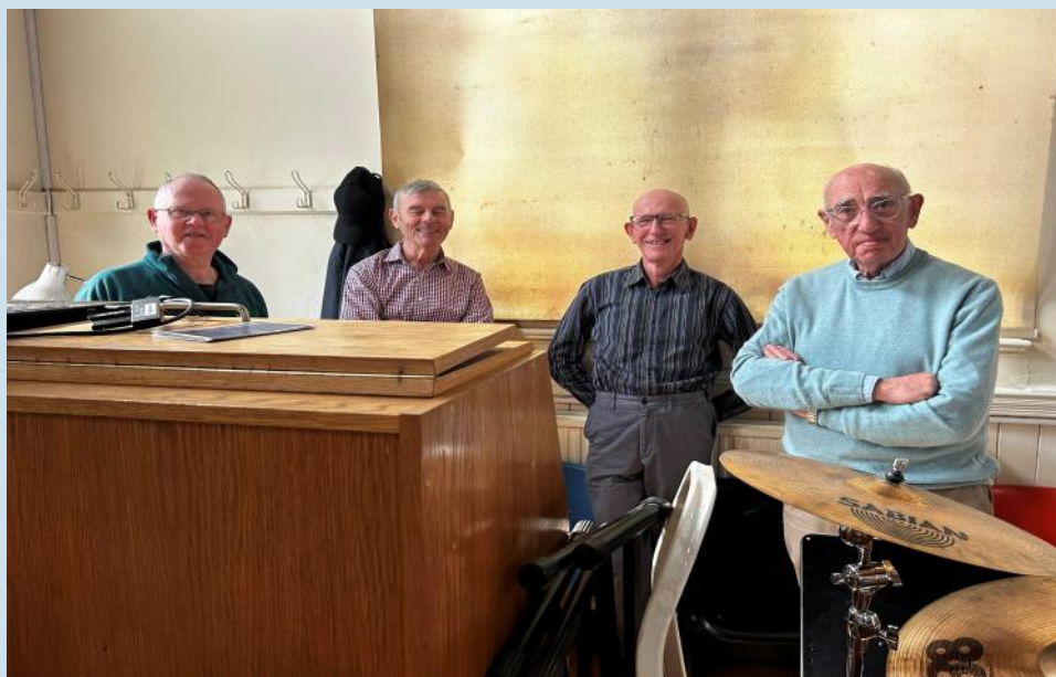
Beeston u3a's very own IT support team