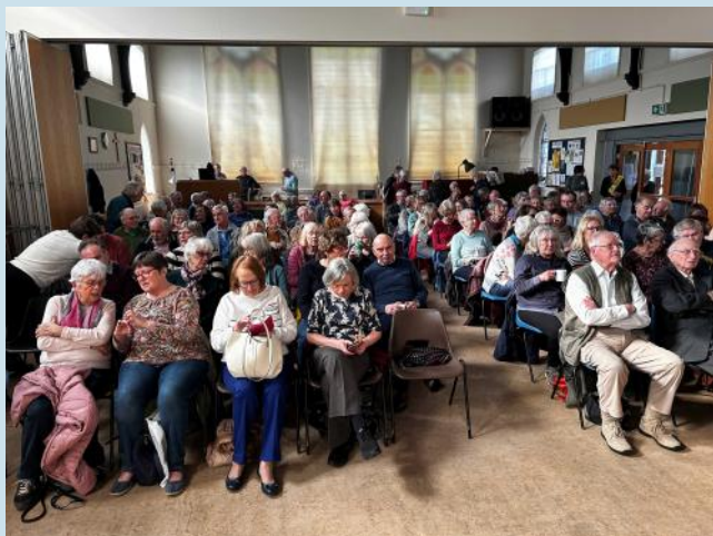
A full house!

Mendeleev's invention of the Periodic Table - a gift to Education (and all of us)