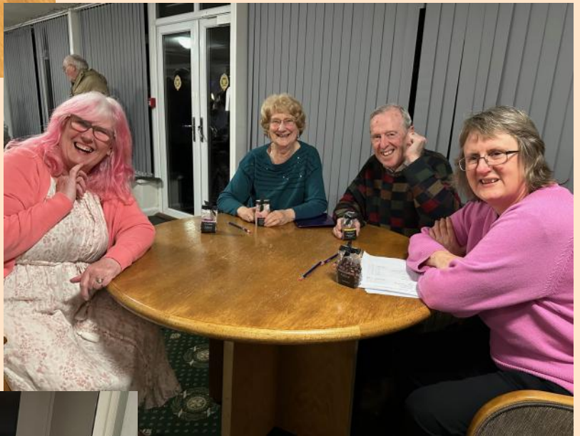
Our Winning Team!