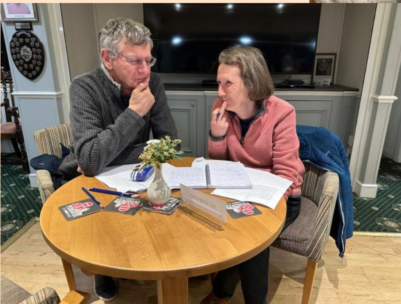
Plotting next year's questions!